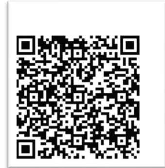
LHMK Website QR Code

Project Description: LHMK Utility and Streets Improvement Project will replace the existing underground municipal wastewater and drinking water utilities and revitalize the streets, associated drainage and pedestrian facilities in the Swan Lake area of Sitka, including Lake Street, Monastery Street, Hirst Street and Kinkead Street. The project will replace the sewer and water infrastructure, install a new underground storm drain system, and replace the stream culverts for Wrinklneck Creek. The project will include sidewalk improvements aligning with Americans with Disabilities Act requirements and signalized pedestrian crossings on Lake Street. All other residential streets will be widened to safe lane widths. The project will rehabilitate all streets and finish the surfaces with new asphalt pavement and striping.